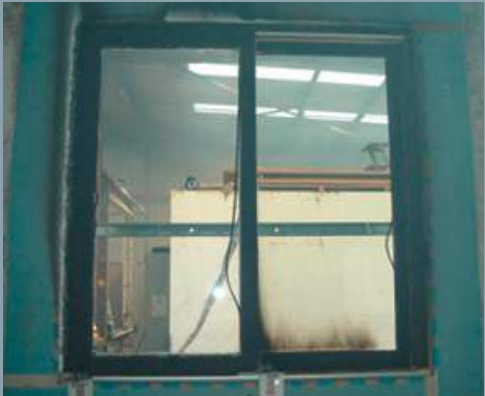
Exposed (Outer) face of a Kömmerling PremiDoor after a BAL 40 AS 1530.8.1 Bushfire Resistance Test

Whether it's for a new build or refurbishment project, our European manufactured and locally stocked uPVC profiles are expertly fabricated into windows and doors across Australia by our network of Kömmerling Window fabricators. This ensures one of the highest quality and highest overall performing bushfire resistant window and door systems currently available.