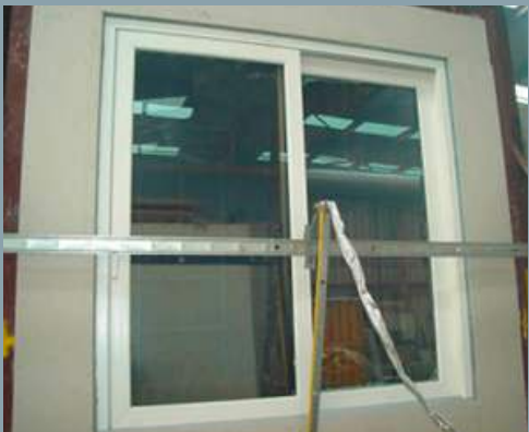
Unexposed (Inner) face of a Kömmerling PremiDoor after a BAL 40 AS 1530.8.1 Bushfire Resistance Test